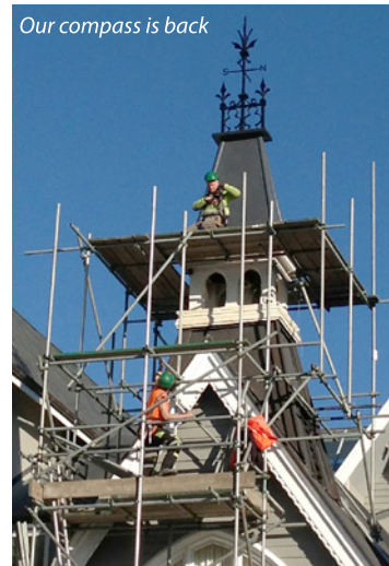
Our compass is back

'Christ's College's help goes far beyond that of one of the oldest Anglican