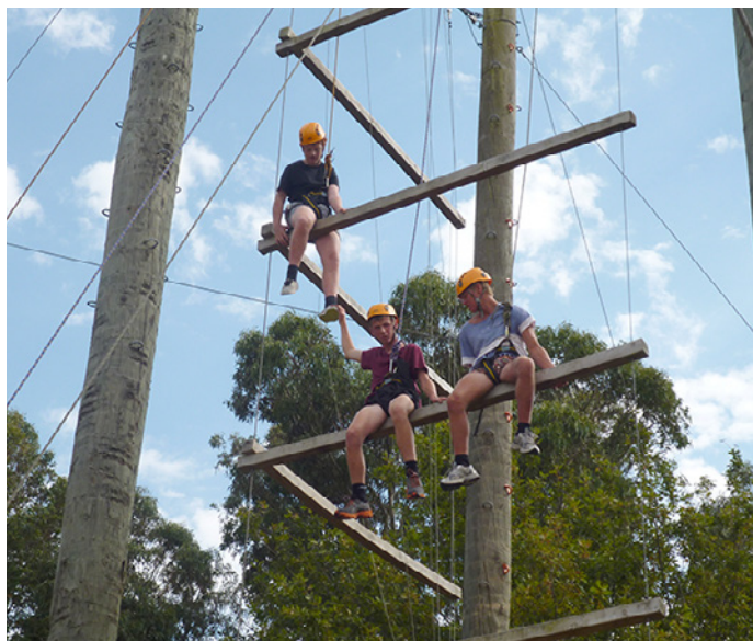
Year 10 High Ropes