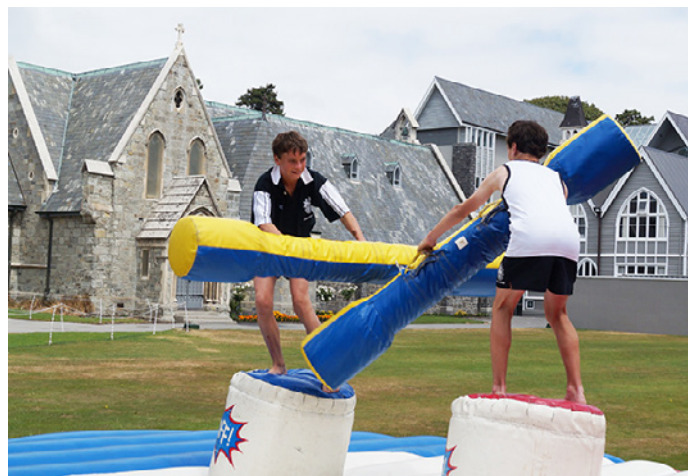
Flower's v School