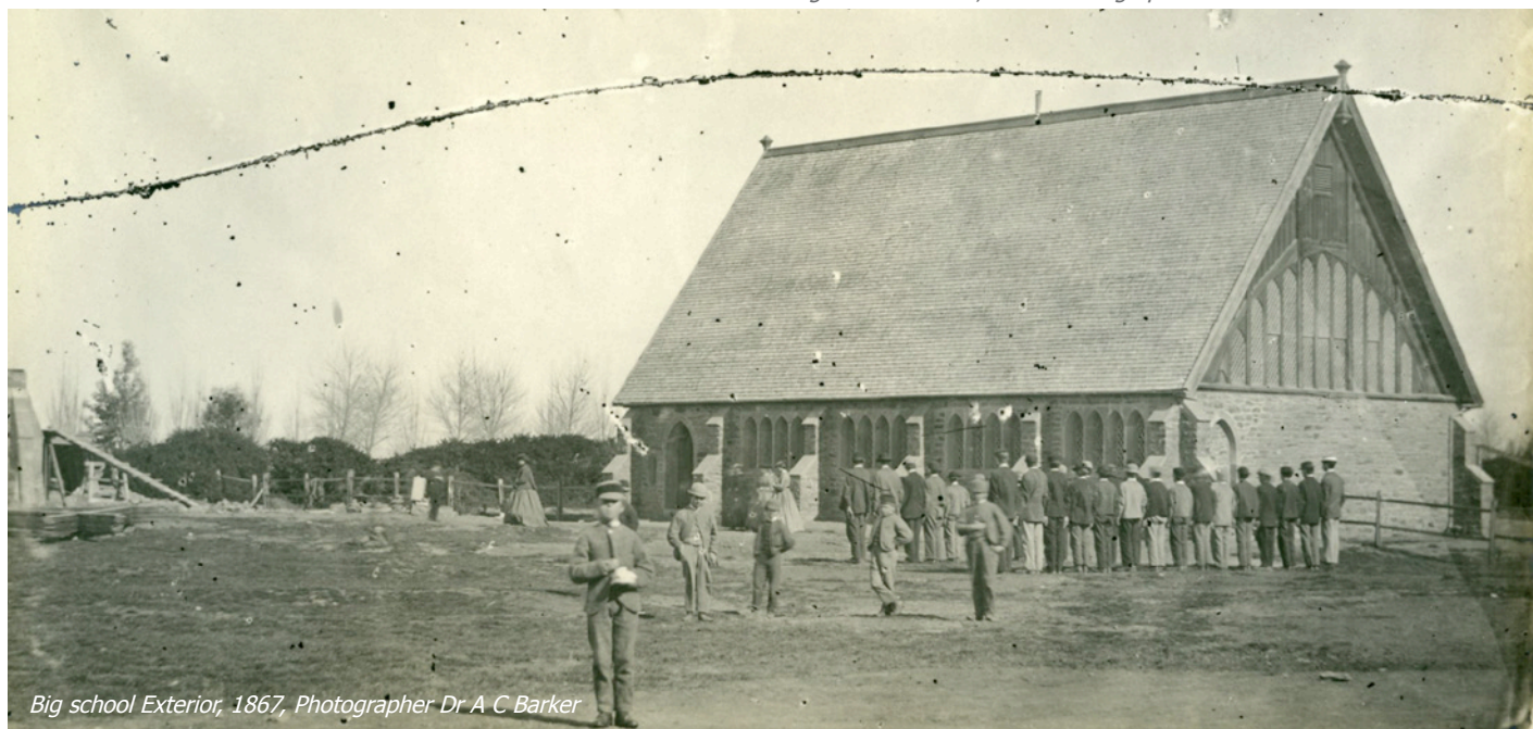
Big school Exterior, 1867