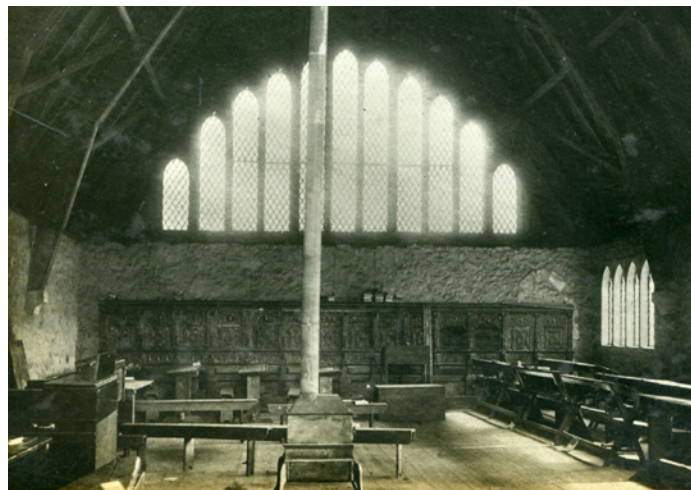
Big School Interior, 1863.

References: College! A History of Christ's College; Webb Scrapbook CC Archives. The Press 10 December 1863, 17 December 1863, 30 January 1864. The Lyttelton Times 19 August 1863, 17 December 1863, 14 January 1864