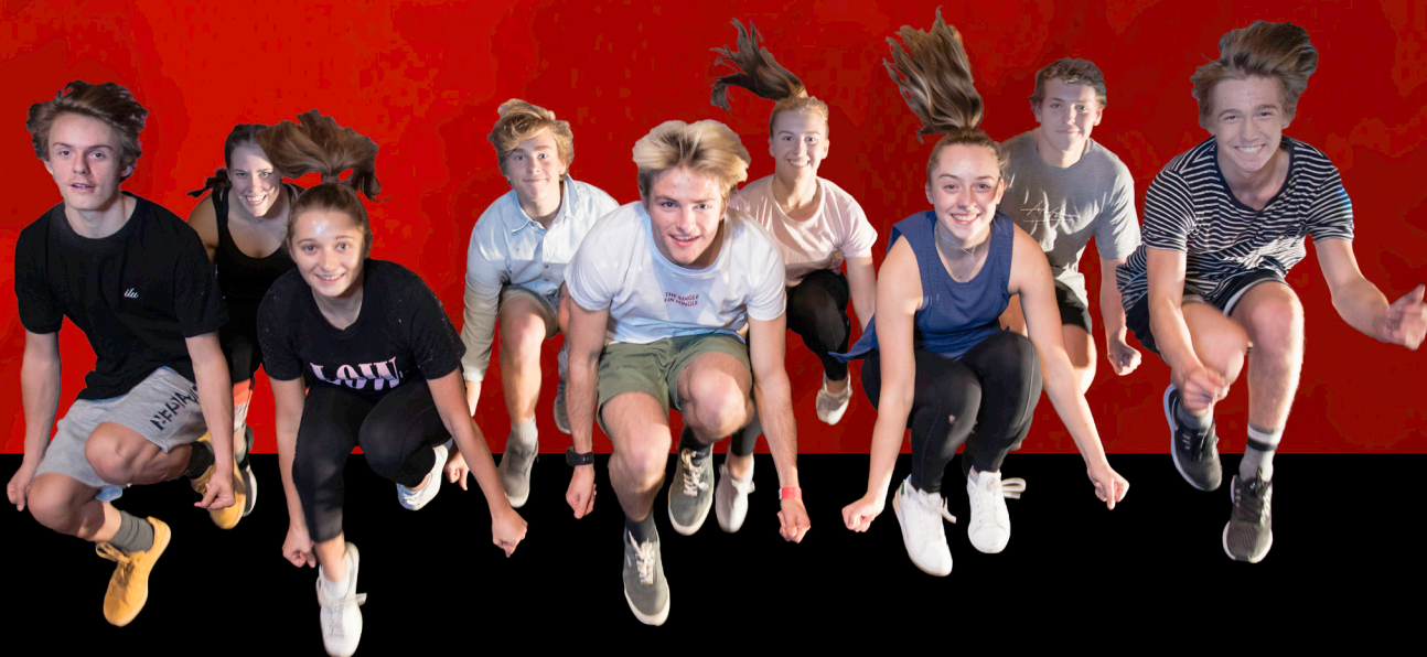
West Side Story cast spring into action.