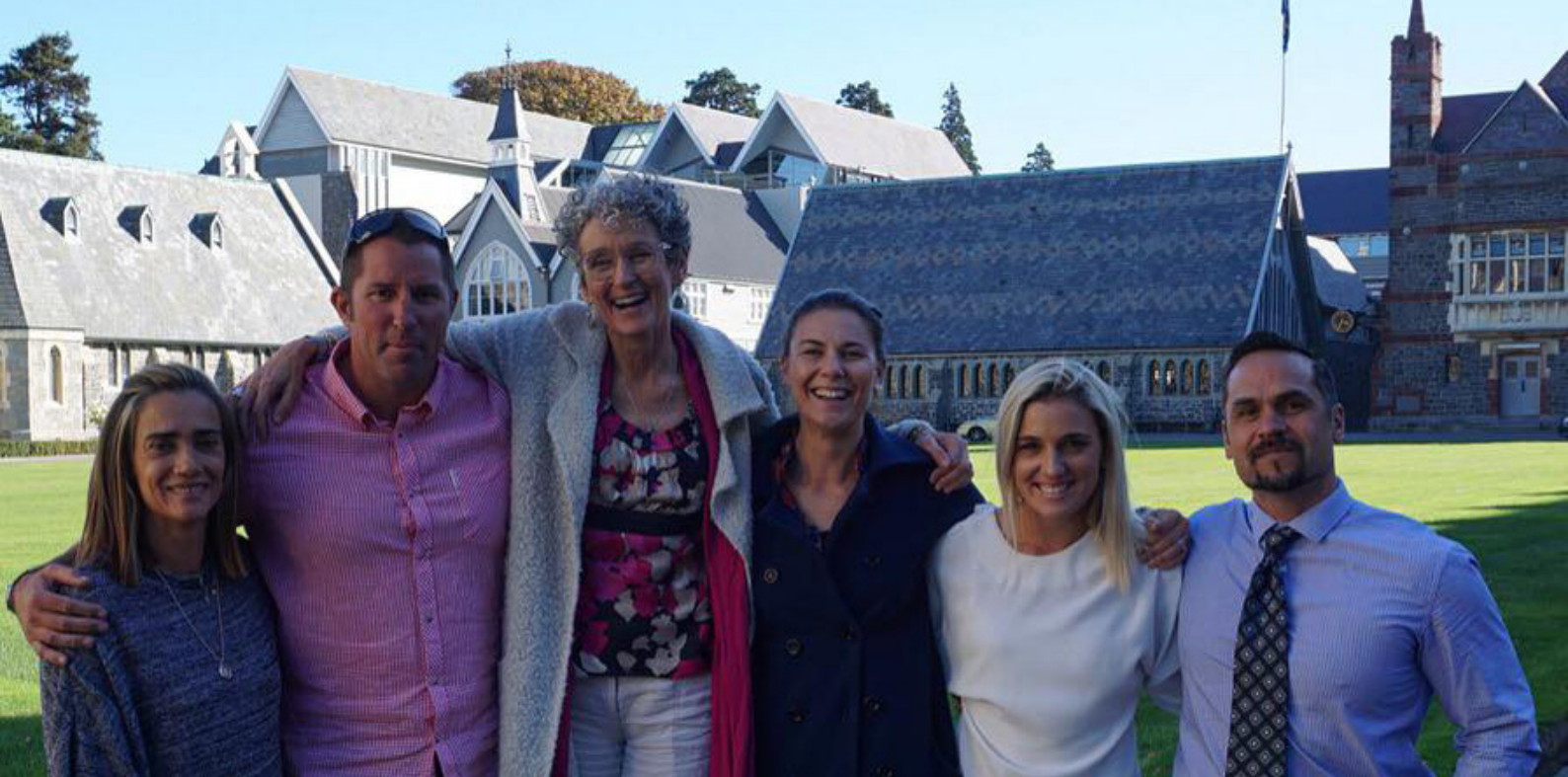
Presenters at the Positive Education New Zealand conference.