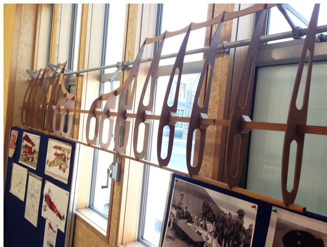
Hard work continues in the repair of The Red Baron.

My special congratulations to our Big Band and Jazz Combo for their successes at Southern Jam. For our very young Big Band to be marginal runners up to the significantly senior STAC ensemble bodes well for future years, and to have the largest number (5) of any school selected for the 'All Stars' was outstanding, and a record. This weekend, Collegium heads to the Blg Sing Finale; hopefully they will all get there, the male contingent having clearly failed to make the St Margaret's congratulatory hoarding on Papanui Road!