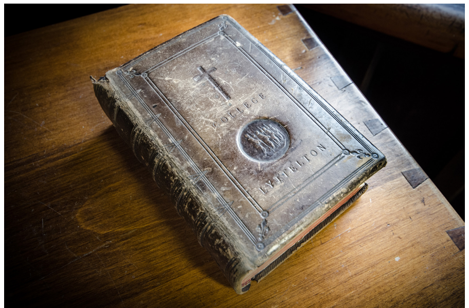
Cover of The Daily Services of the United Church of England and Ireland

the Upper and Lower Departments had not separated at this time. There is also an additional prayer that reflects the changing composition of the Royal Family on Edward VII’s death in 1910, when George V ascended to the throne.