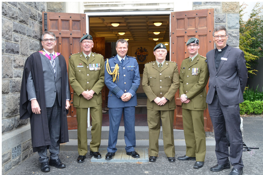
Bosco and Garth with representatives from the New Zealand Defence Force Chaplain Service