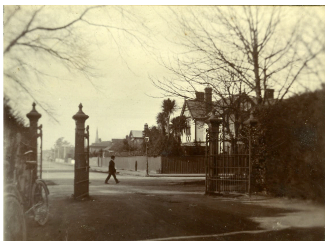
Gloucester Street from the College Gates, Christ's College Archive CCPAL14/5/1