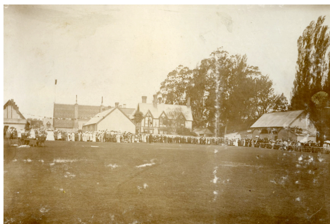
Sports Day 1906, Christ's College Archives CCPAL1/9/1