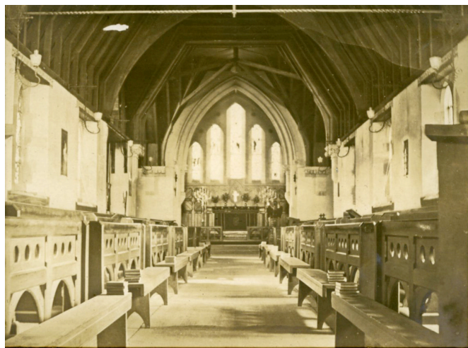
The interior of the Chapel, Christ's College Archives CCPAL14/8/1