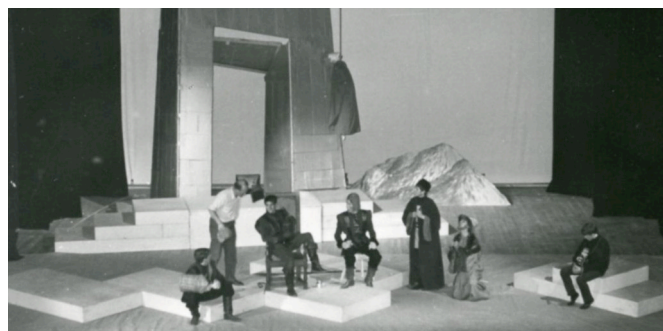
The Caucasian Chalk Circle used the full apron stage for the first time.

The gym display, with long and broad horses, parallel and horizontal bars, mats and human pyramids “left the less agile members of the audience green with envy”. Boxing bouts ranged from flyweight to