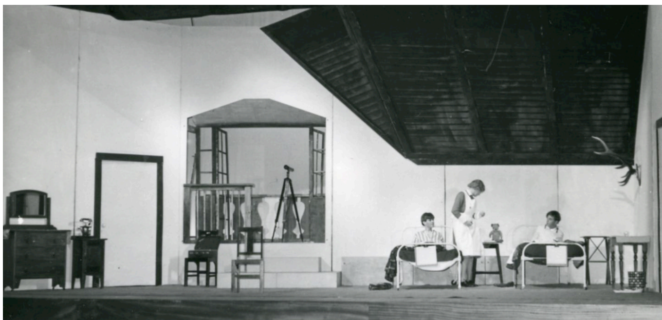
The set of All for Mary