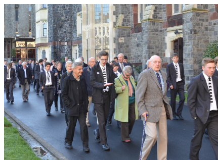
Grandparents' Day, Friday 19 May 2017.