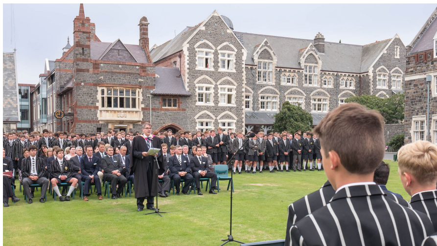
Powhiri welcoming new students and staff.