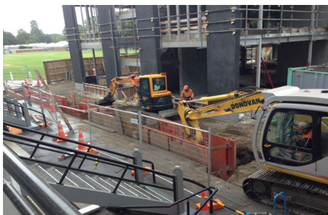
Essential drainage work for the West Wing.

place. A couple of pictures will give a reasonable impression. In addition, the beautiful dining hall window on the avenue is admired by all, the Chapel temporary works have all been replaced by permanent repairs, a few superficial cracks in Flower's House have had industrial strength Botox and a repaint, the assembly hall has had all sorts of unseen love and attention, and School House has a beautiful new chimney which few will ever appreciate, unless they make a special point of looking up from Hagley Park. Our 'West Wing' is really taking shape now. Briefly, whilst the hoardings were down, we had a glimpse of what that end of the school will be like at the end of the year. I have always felt once beyond the quad, the school architecture was 'functional' but hardly inspiring; when this project is finished, it will be both.