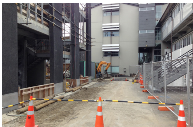
A glimpse at the spaces when it is all done.

Our NCEA results once again are at a level we have come to expect. Excellence endorsements at Levels 1 and 2 have risen to extraordinary levels, but we have seen some slippage back into the Merit area at Level 3. Whilst still above averages for all schools and also for high decile boys' schools, perhaps surprisingly I welcome the rigour required to achieve at that level. After national statistics were published by NZQA following the 2012 examinations, I expressed my concerns to them about every graph in their analysis trending upwards. We were seeing inexorable grade inflation - which has rendered outcomes in other systems almost meaningless. Whilst these graphs may be held up as evidence of success of political and educational initiatives, the emperor and his new clothes spring to mind. Top level qualifications should remain a 'gold standard' out of reach to all but the most committed and determined.