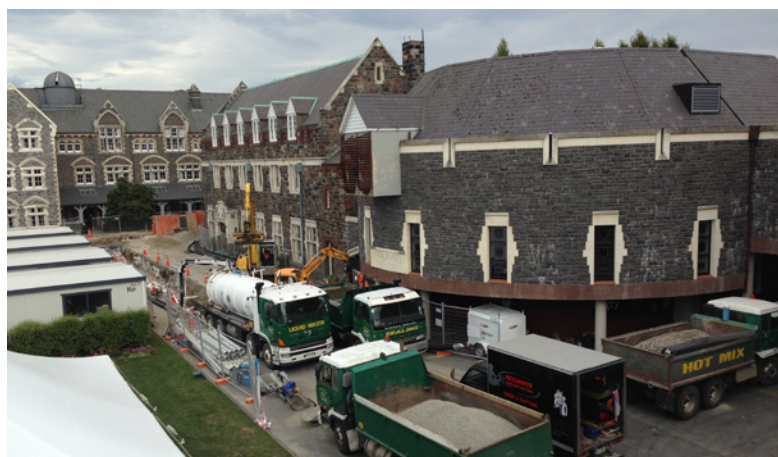
Manic activity in the driveway during the summer break.