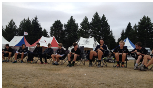
Rowers fuel up between races