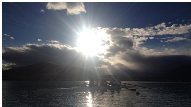
Early morning training on Lake Ruataniwha