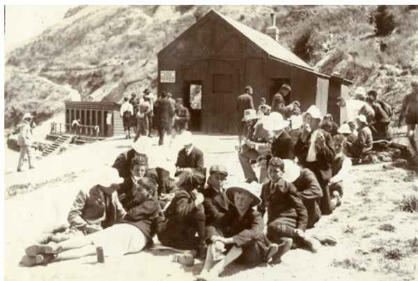
Corsair Bay Picnic 1907 Lusk Album CCPAL/1

This did not however detract from swimming elsewhere. From 1895-1932 there was the annual day long adventure to Corsair Bay. It involved a train trip, either a long walk or a trip in a small boat and a picnic. This use of the bay began long before its 1906 formal opening as an official bathing place, although the