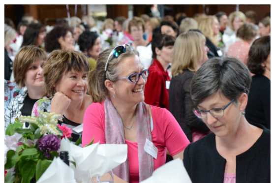
Parents enjoying the 2014 Pink Lunch, an event organised by the Christ's College Parents' Association