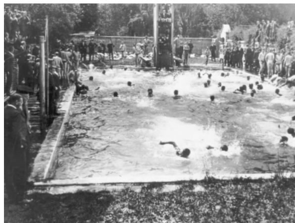
The Swimming Pool mid 1920's

Although the College pool was later extended to 33 1/3 yards it still had one major drawback – it was freezing – an upgrade was necessary. Part of the proceeds of the 1990 College Fair were contributed towards the cost and in 1994 a heated, covered 25m pool was opened by the then Prime Minister, J B Bolger. The fence that had become part of the pool surrounds in 1911 was incorporated into the Sir Miles Warren design.