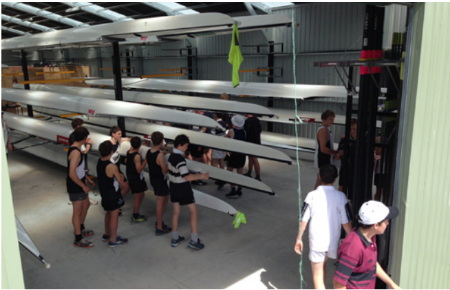
The newly installed racking in the boat shed, has made a big difference to life at Kerrs Reach