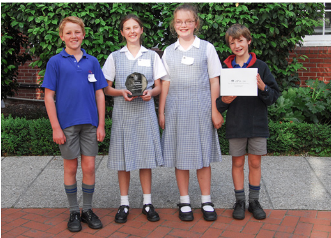
First place winners Cobham Intermediate

Christ's College staff enjoyed the energy and enthusiasm these budding scientists had to offer, and the students themselves had a fun time exploring some of the mysteries of science, and becoming enthused about studying science in the future.