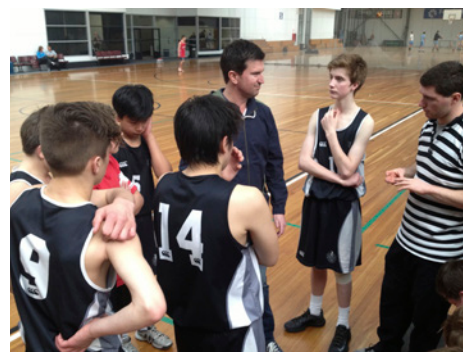
Year 9 Basketball prepare for their game