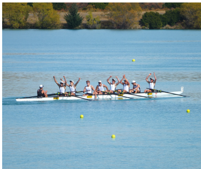
Under-17 eight after winning gold at the New Zealand Secondary Schools' Rowing Championship, held at Lake Ruataniwha