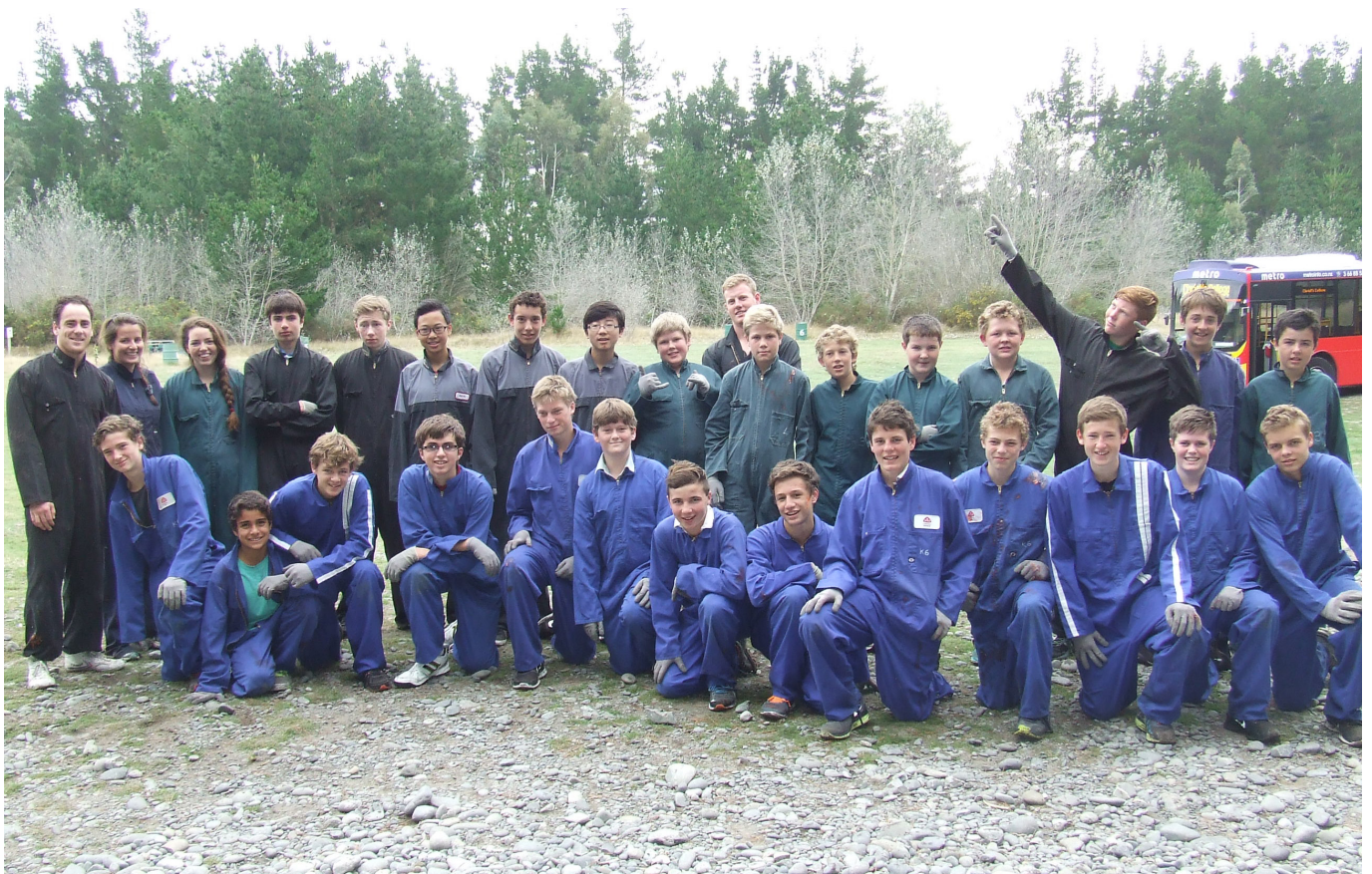
Boarders enjoying a game of paintball out at Mcleans Island