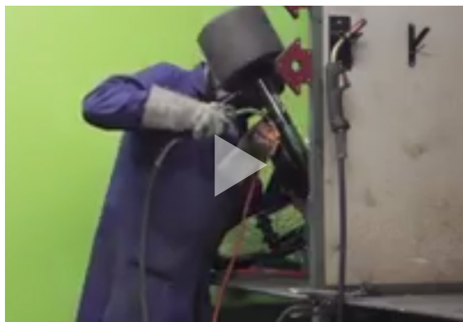
Another short clip of what our boys get up to in the weekends