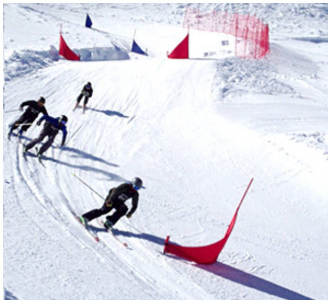
Gemmell and Wheelans lead their ski-cross heat on Sunday. Final positions 5th and 6th place.