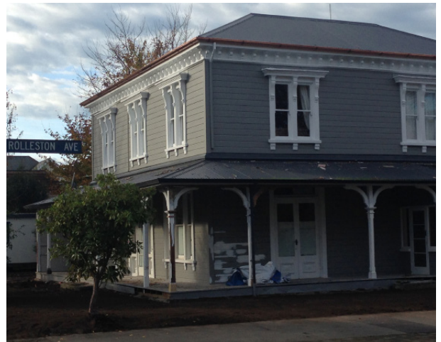
4 Armagh Street

When was the house built? This is much more difficult to work out and there is no evidence of a tender notice in the newspapers. However, there are other ways of working out an approximate date.