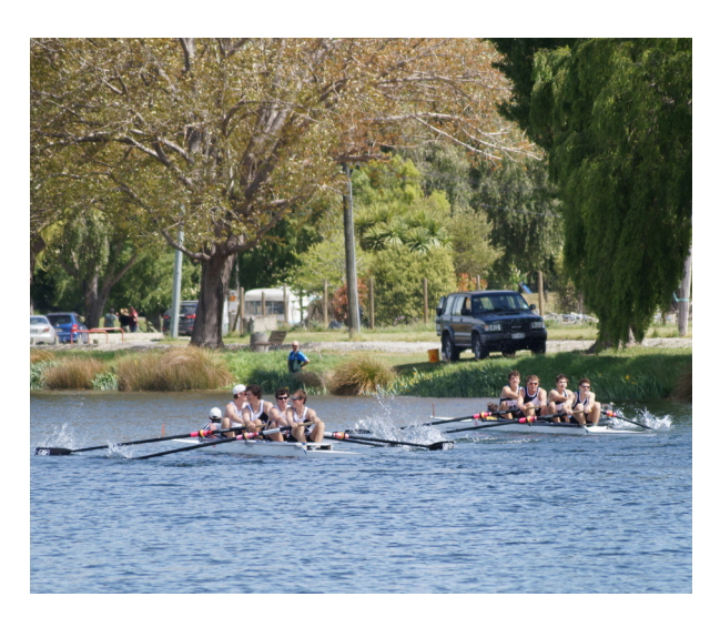
Flower's and Harper compete in the 2014 Interhouse Fours at Kerrs Reach.