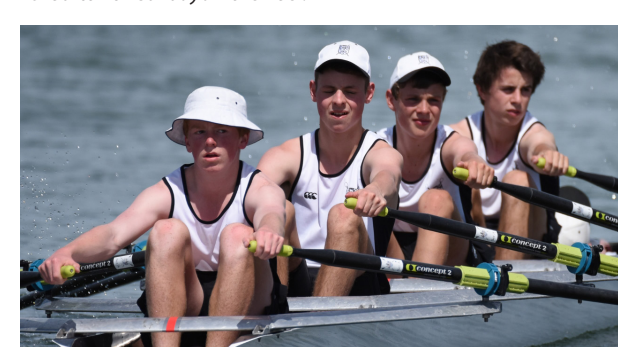
A Christ's College quad rowing in fantasy conditions on Lake Hood, in Ashburton.