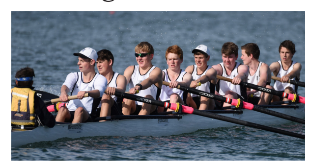
A Christ's College eight competing at the Clark Boyce Pennant in Ashburton on Sunday 9 November.