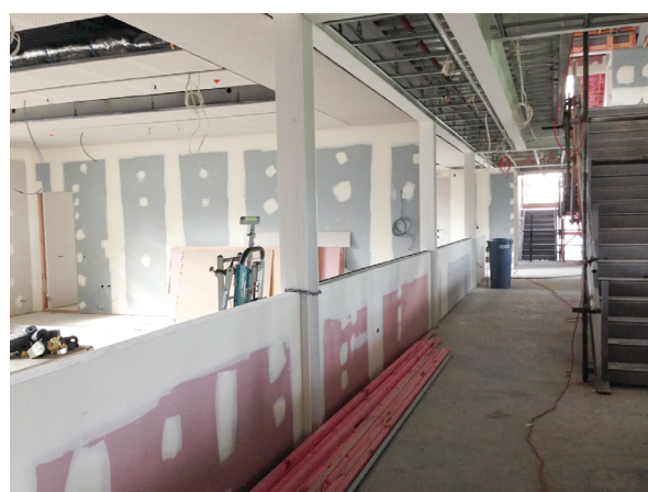
New teaching spaces being created in the Warren Building