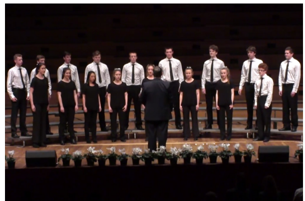
Collegium at the Finale of the NZ Choral Federation Secondary Schools' National Big Sing Competition