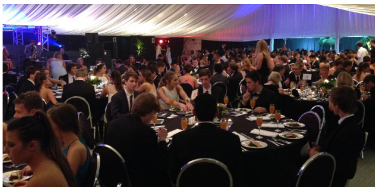
Another great ball enjoyed by everyone