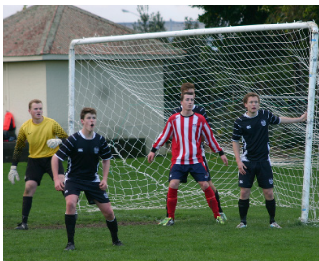
1st XI Football vs Hutt International - National Tournament (Napier)