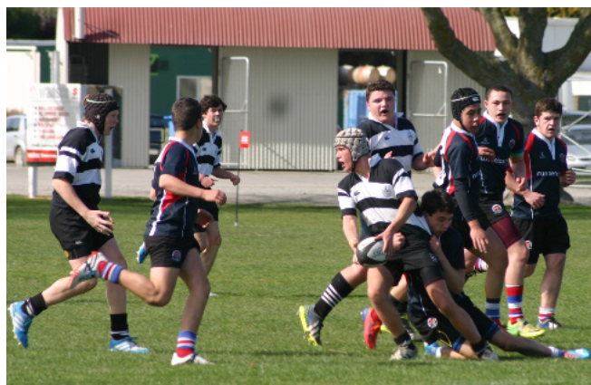
Under 15 Rugby vs Southland BHS - South Island Invitational (Blenheim)

Game 1 - Sacred Heart College (L 1-5) Game 2 - Wellington College (L 0-2) Game 3 - Tauranga Boys (W 1-0) Game 4 - Hutt International (D 1-1 lost on strokes) Game 5 - Lincoln HS (W 1-0) Game 6 - St Pauls Collegiate (L 1-0) Game 7 - Otago BHS (Draw and won on strokes) 19th place