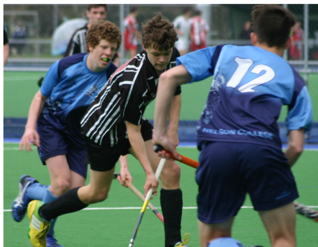
1st XI Hockey vs Nelson College - Rankin Cup (Palmerston North)