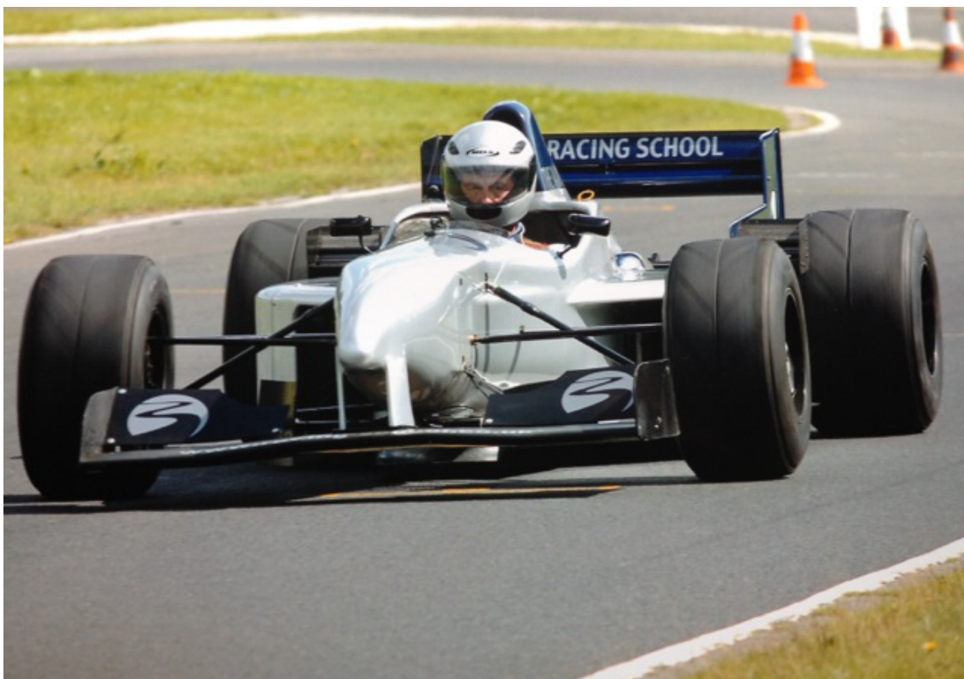
Our Headmaster achieves his ambition of driving ex F1 car. A huge tick on the bucket list. 600bhp!