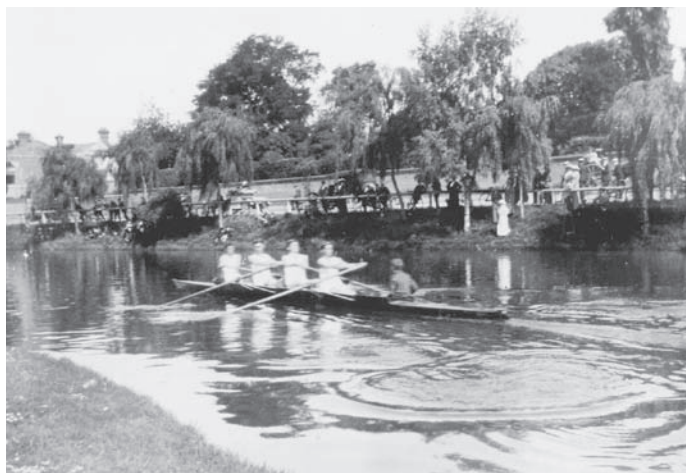
College IV 1913

In 1918 a black ribbon was added to the edge and collar and four inches up the sleeve from the cuff. In that same year there was obviously some concern about the physical