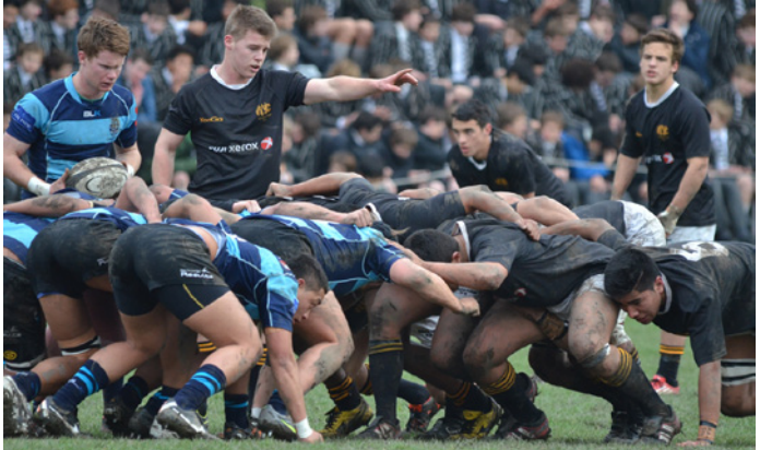
denied and scored a late try wide out but failed to convert. Final score 31–all.

A thrilling end to another very good Quadrangular tournament. Next year, 2013, Nelson College will host the 87th.