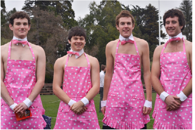
Best Dressed winners, Flower's House