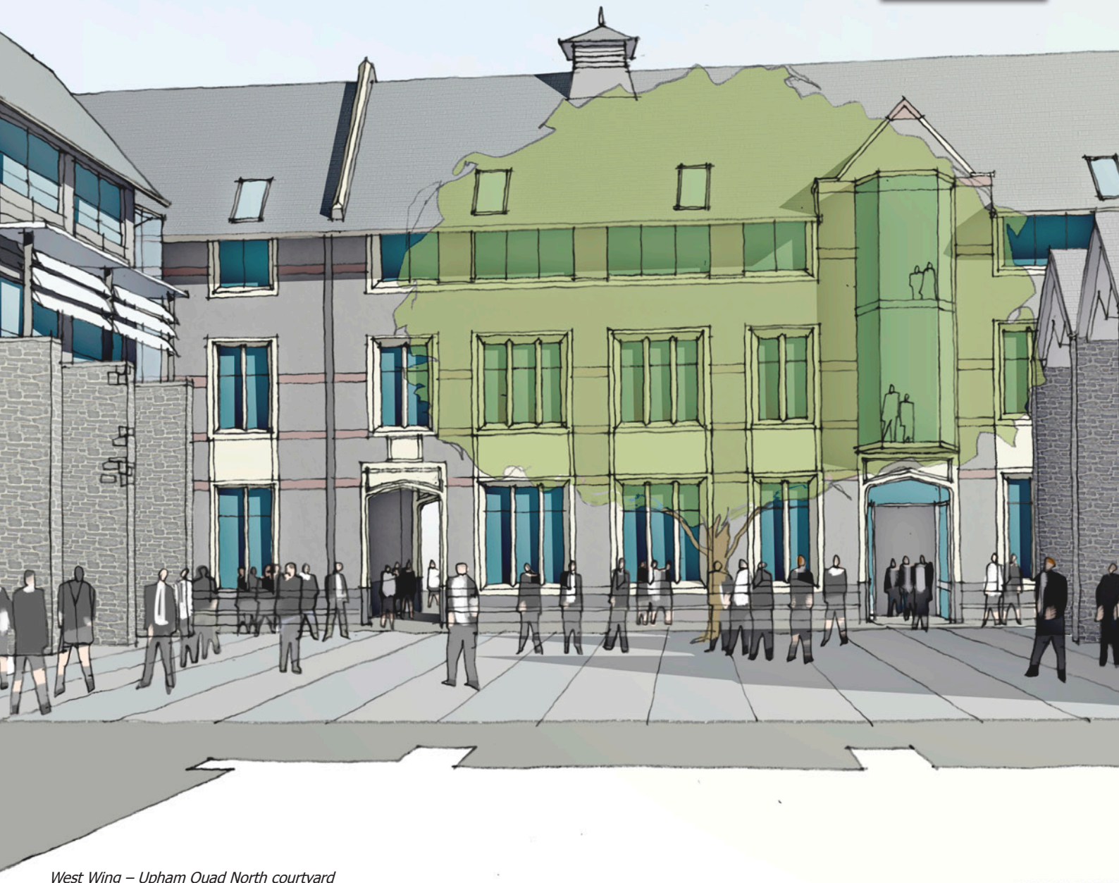
West Wing – Upham Quad North courtyard