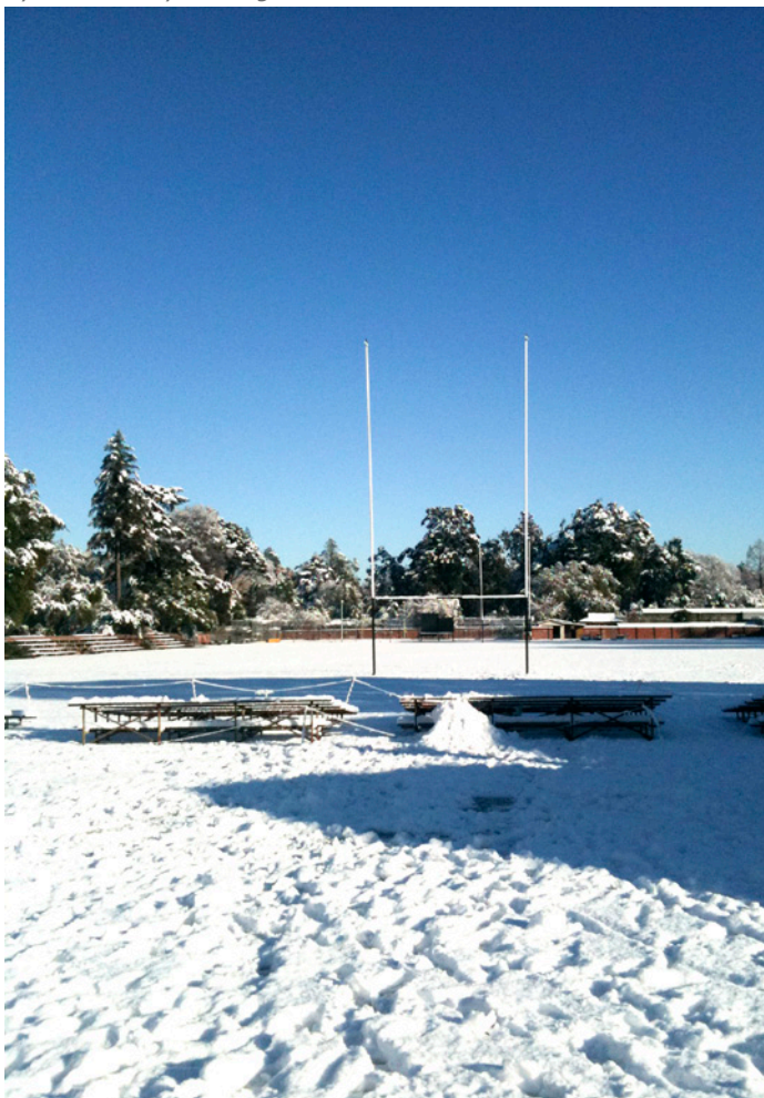
Upper – Thursday morning