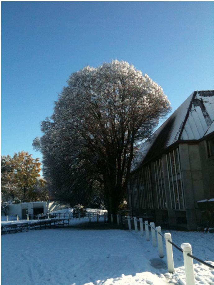
Gym – Thursday morning