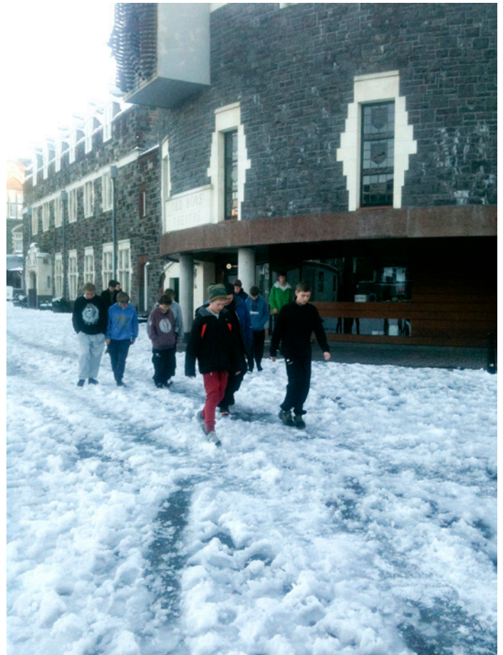
Boarders walk to breakfast