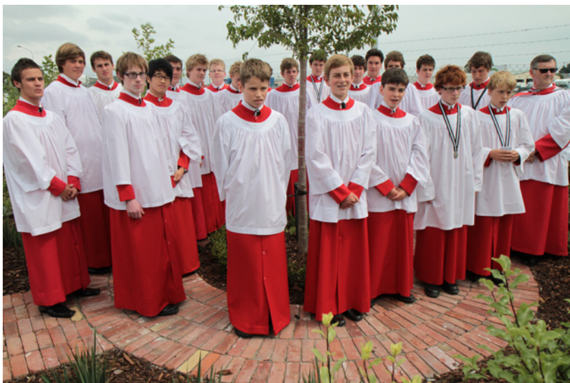
The Chapel Choir at The Press memorial service