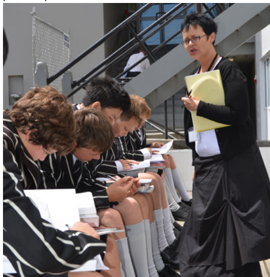
Year 9 Orientation