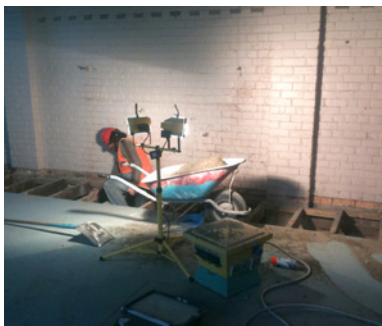
Foundations for the new Harper/Julius sheer wall near completion