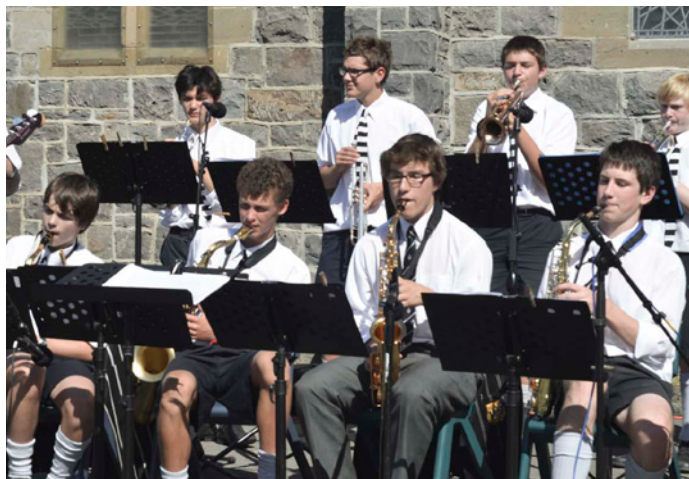
Big Band perform at Open Day