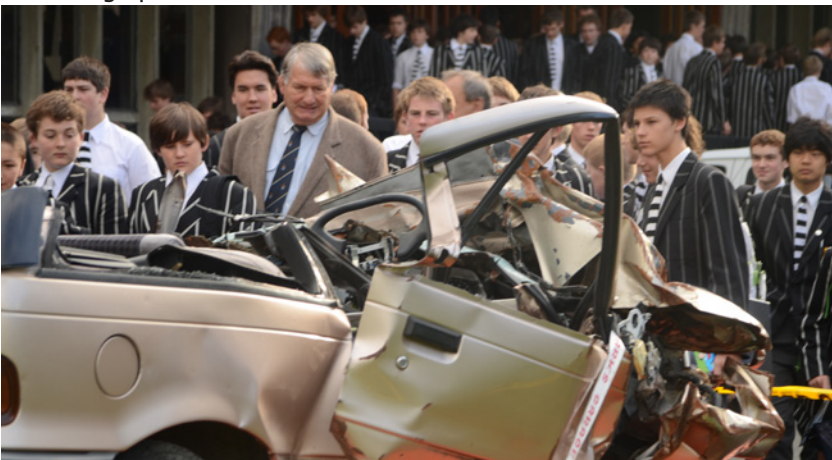
Crash Bash presentation