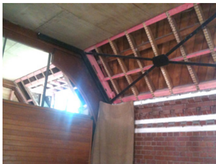
Harper/Julius roof bracing frames, and ply ceiling diaphragm completed before steel framing is installed