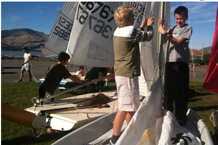
Preparing to sail in Lyttelton Harbour