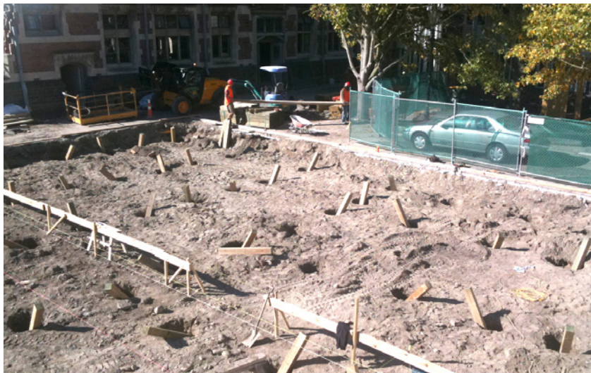
West end subdivision takes shape (for the remainder of the year only)