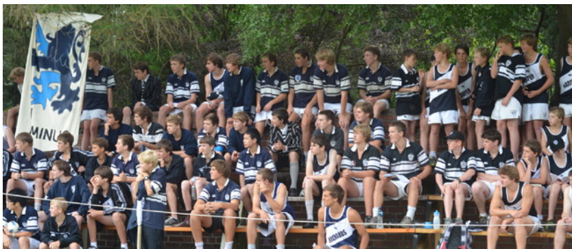
Richards House supporters during the Athletics