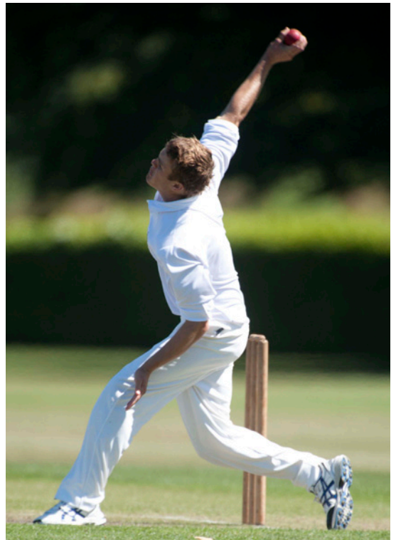
Cricket, Otago Boys' High School Summer Tournament