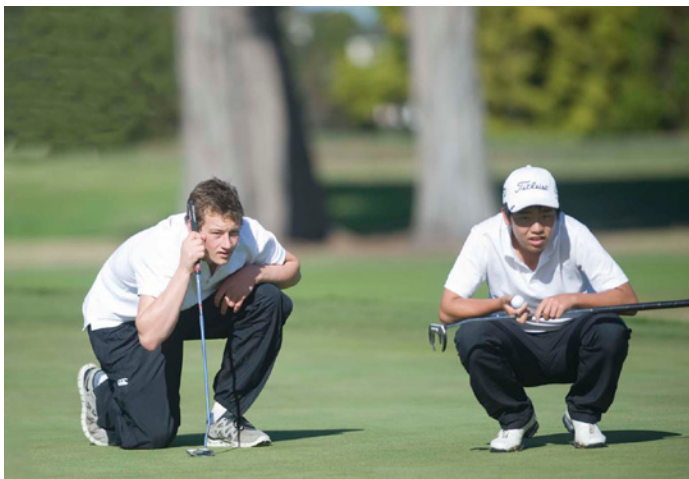
Golf, Otago Boys' High School Summer Tournament