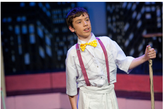
Shake, Ripple and Roll production