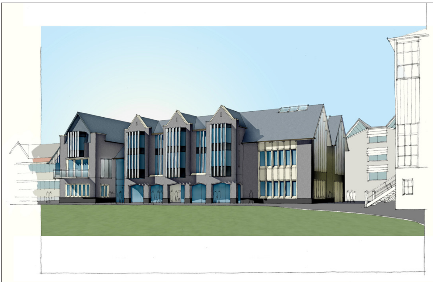
Architect's drawing of the new 'West wing'