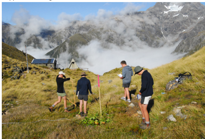
Biology Field Trip at Temple Basin