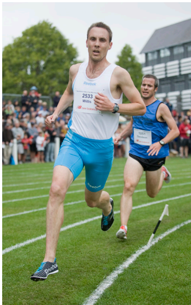
Olympic Silver Medalist Nick Willis running at the International Track Meet on Upper