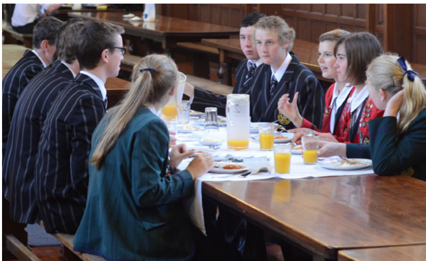
Combined Valentine's Day breakfast this morning in the Dining hall