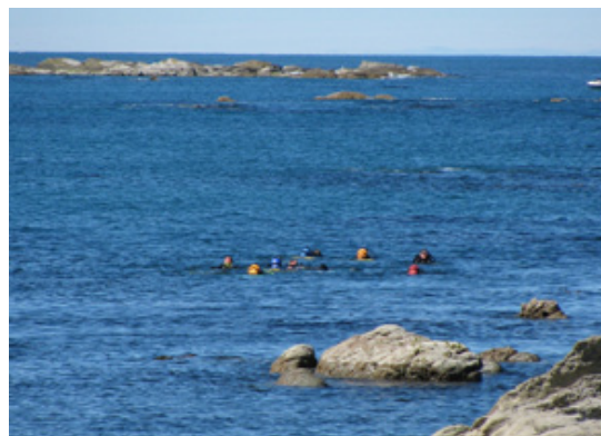
PADI dive group heading for the reef, South Bay, Kaikoura