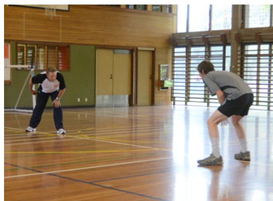
Ian Healy demonstrates wicket keeping techniques in the Christ's College gymnasium.

Healy, a specialist wicketkeeper and right-hand middle-order batsman first played for Australia in 1988. By the time of his retirement he held the world record for the most Test dismissals by a wicket-keeper.