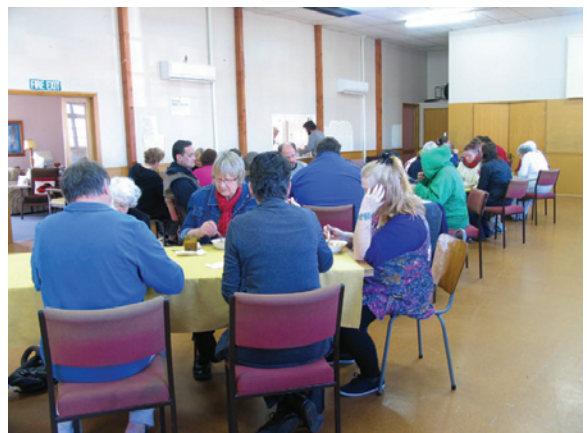
A community lunch held in a church hall in New Brighton