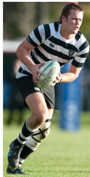
Images from the 1st XV season