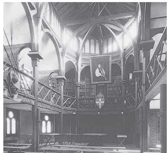
The interior of the Synod Hall. The library can be in the gallery at the west end. This library was an accumulation of books donated in England prior to the sailing of the Canterbury Association Ships, and later New Zealand based purchases and donations. Some books from this library survive in the College Archives.