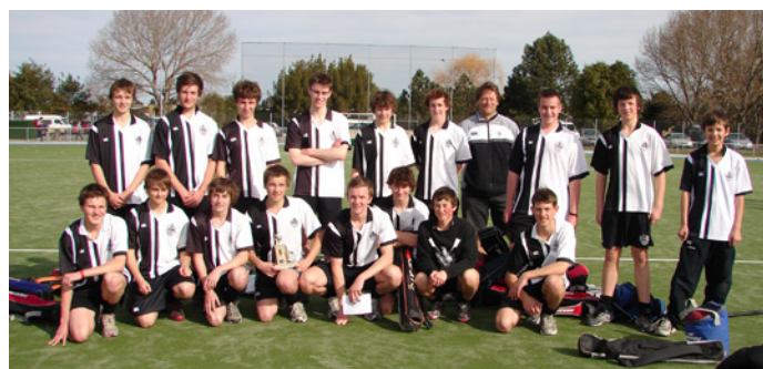
2nd XI Football team

We would all love your support next Sunday evening, 4 September, for the final. Time to be confirmed.