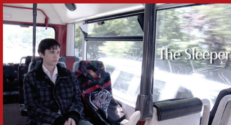
Opening scene of The Sleeper