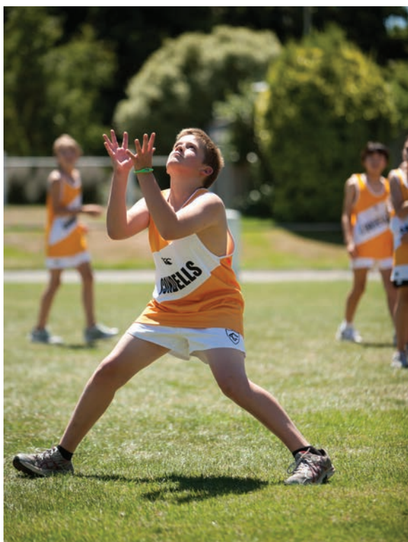
Y9 Multisport during Orientation day