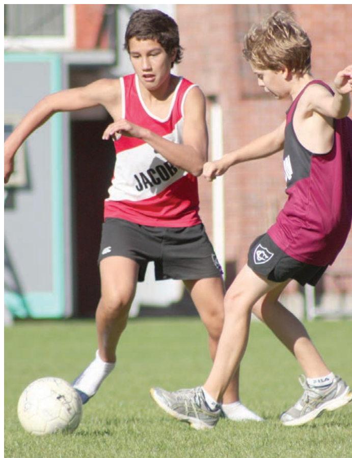
Interhouse Five-a-side football