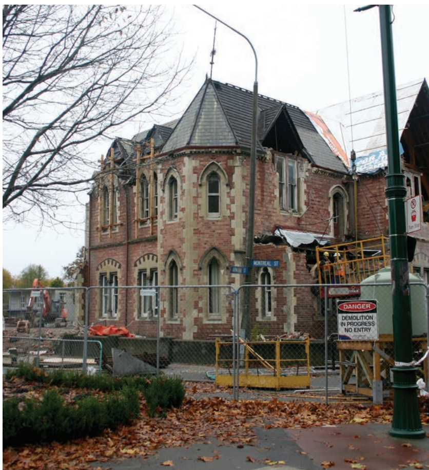
The deconstruction of Cranmer as at 3 May 2011.

Let's hope CERA has a desk marked 'dispensations'. That is where you queue up to explain what you want to do and why, and you come away with a fast track approach to the outcome you need. Behind you in the queue is an unscrupulous opportunist – who gets sent away with a flea in his ear. What we really need is intelligent flexibility, and regeneration leaders with the courage to insist upon it. The future of Christchurch is certainly exciting, but the moment needs to be seized to get things moving quickly.