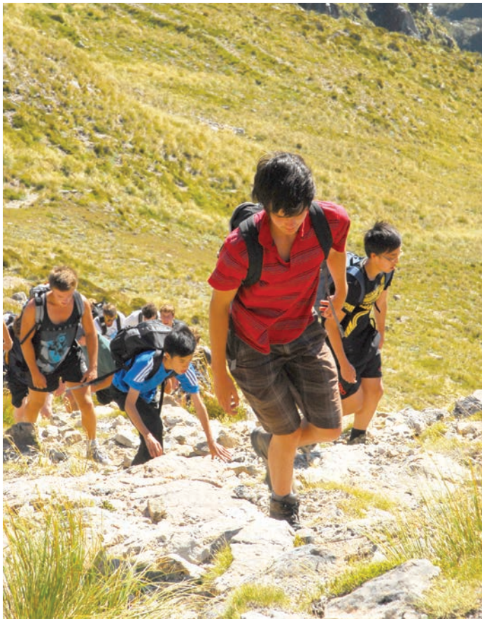
Biology field trip to Temple Basin