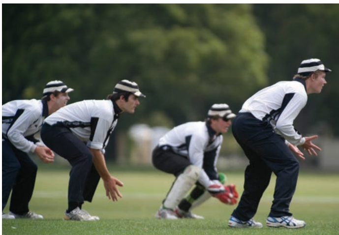
Trans-Tasman Cricket Festival