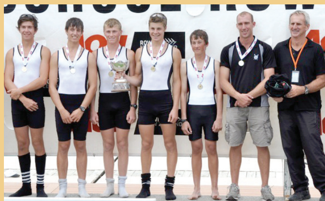
U18 Lightweight Four collect Gold.