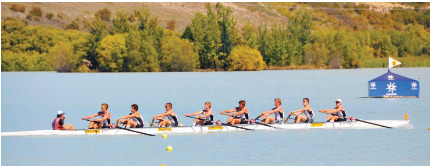
South Island Secondary Schools' Rowing Championships. First VIII crew.