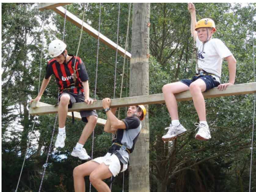
High Ropes – Boarding Programme