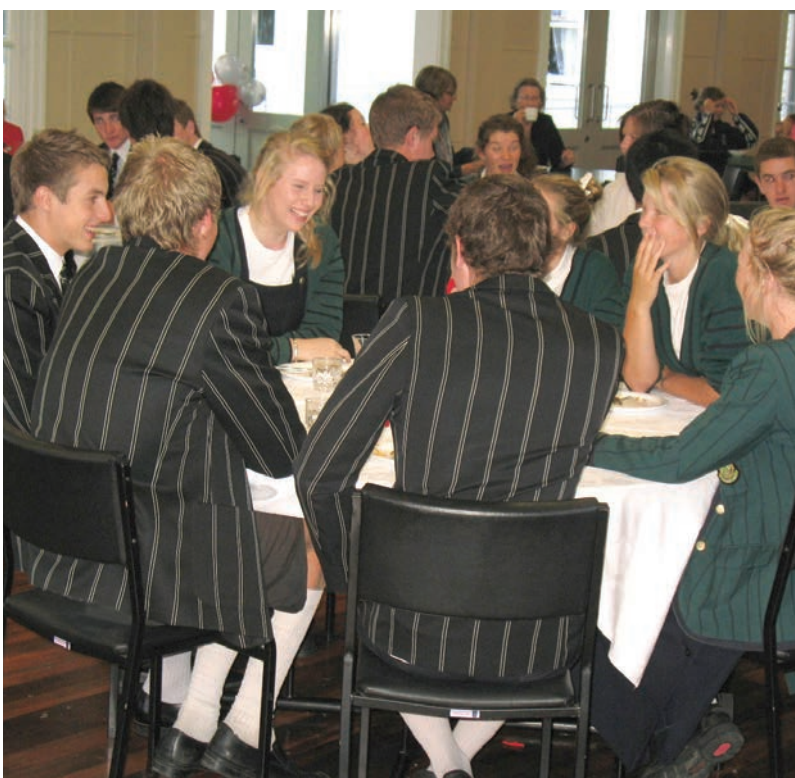
Valentine's day Breakfast