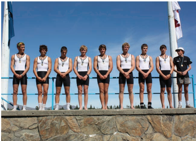
Gold Medal winners at the South Island Secondary Schools' Rowing Champs - Under 18 eight.

Christ's College last won the Maadi Cup in 2006, having won five times since 1995. Hamilton Boys' High has won the race each year since. The Christ's College under-18 eight won gold at the 2011 South Island Secondary Schools' Championship recently, with Auckland Grammar taking gold at the North Island event.