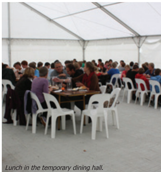
Lunch in the temporary dining hall.