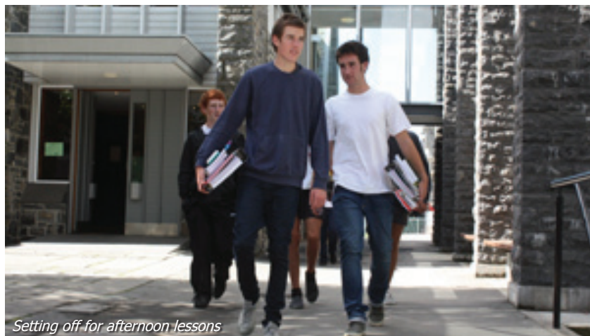
Setting off for afternoon lessons