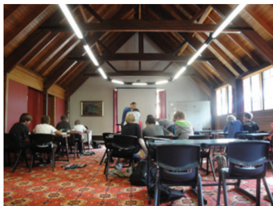
The boardroom, New Zealand's plushiest classroom?