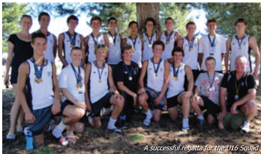
A successful regatta for the U16 Squad

The Club now looks forward to the New Zealand Secondary Schools Championships at Lake Karapiro which include the Maadi Cup challenge, after the briefest respite back in Christchurch.