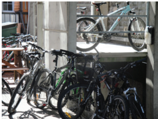
The Headmaster's long held wish for more cycling by boys begins to eventuate.