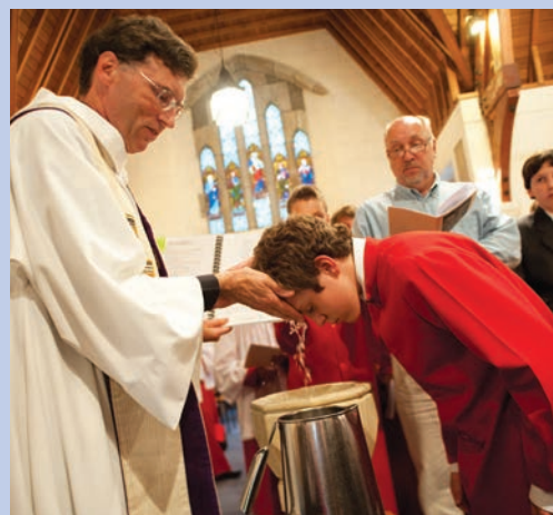
The baptism service in 2010