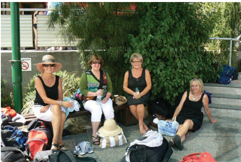
Boarding House Matrons joined the Year 9s in Hanmer.