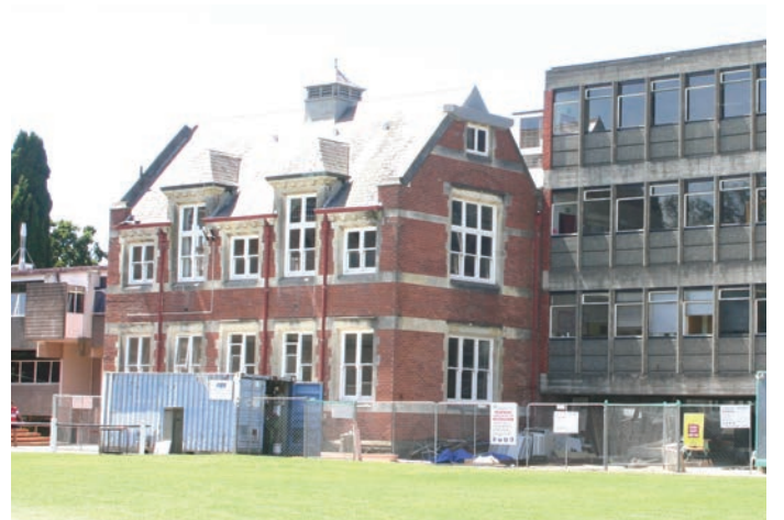
Building the Labs and Classrooms 1920-21