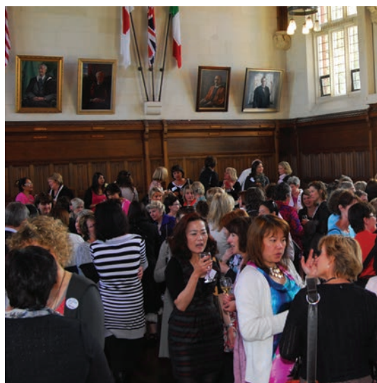
Pink Lunch 2010