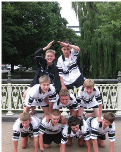
Ultimate Race 'Pyramid' task